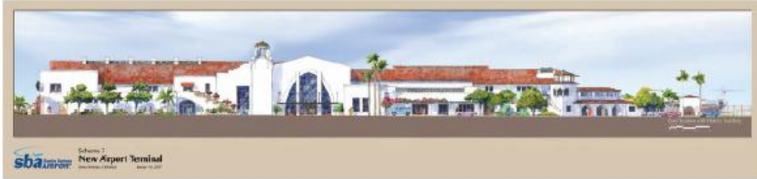
Schematic New Airport Terminal Santa Barbara Airport