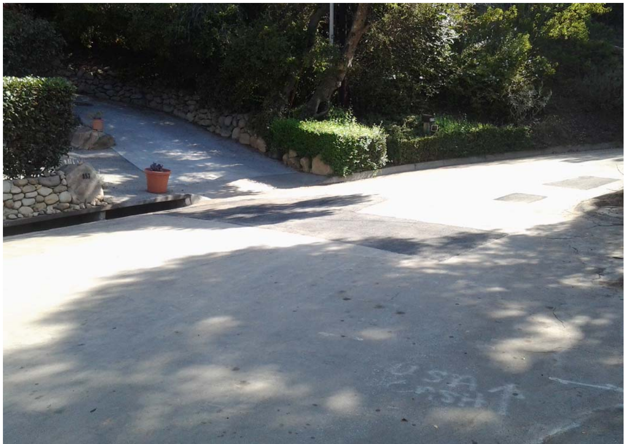
Site Location Following Construction