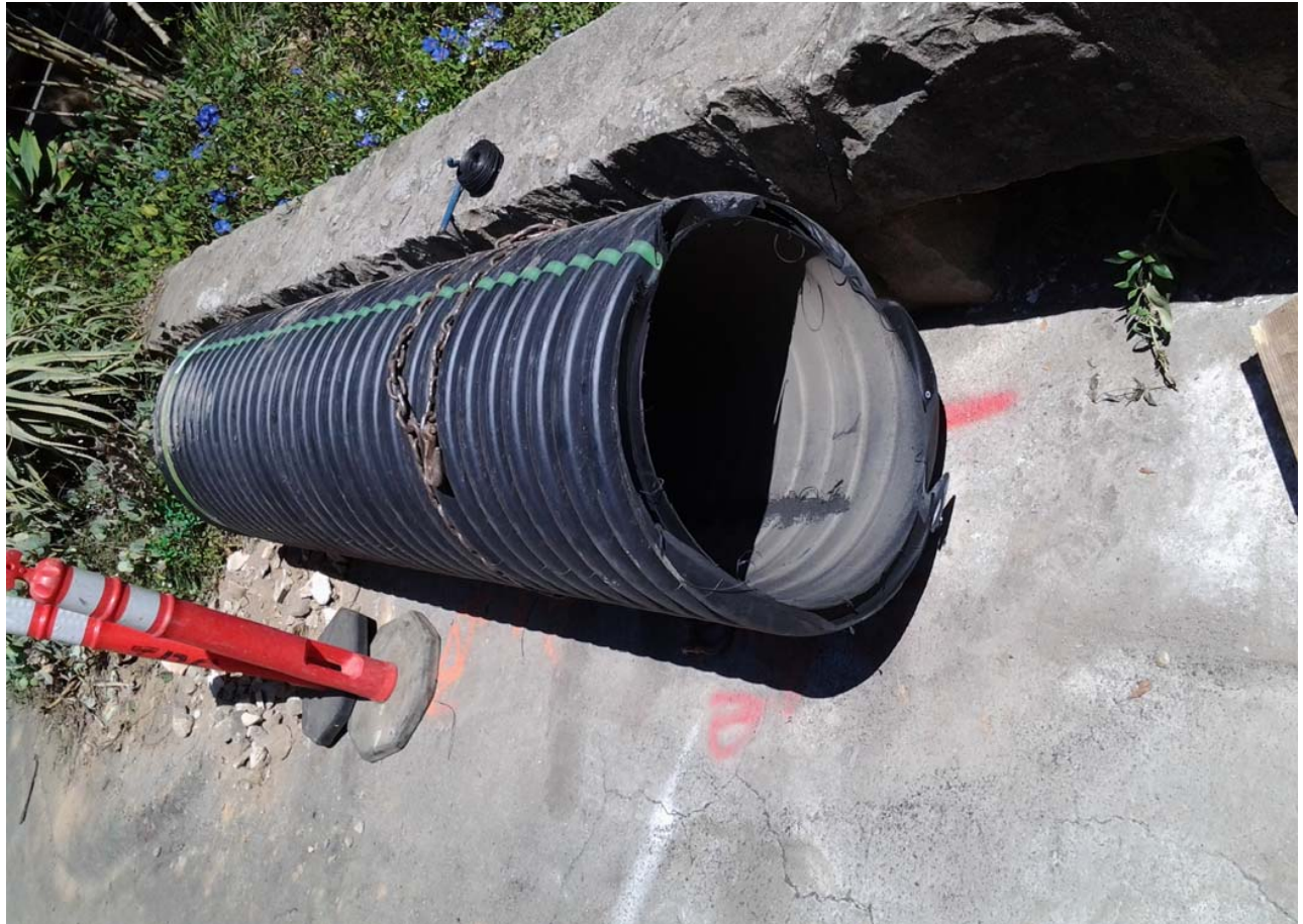
Section of New 24-inch Corrugated High Density Polyethylene