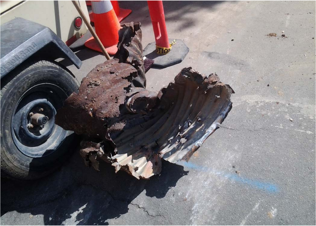
Removed Section of Rusted Corrugated Metal