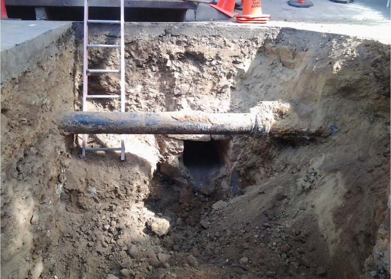
Excavation Prior to Storm Drain Replacement (Looking Upstream)