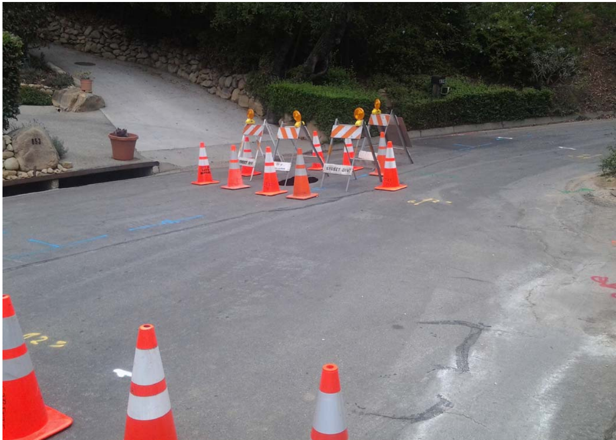
Location Prior to Construction