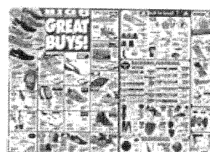
BIG 5 SPORTING GOODS 3 DAYS LEFT