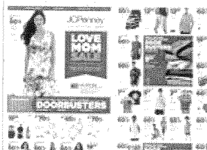
JCPENNEY JUST RELEASED