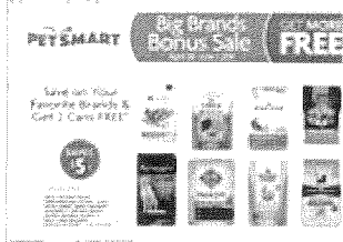
PETSMART USA VALID UNTIL JUN 01