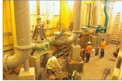
2016-2021 Capital Improvement Program February 2015