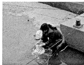
Education is a major component of the program

Clean Marinas are not only good for the environment they are good for business. Good water quality means good business.