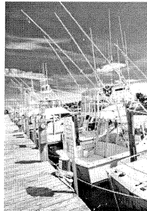
The Clean Marinas California program is good for the environment and for the marina industry